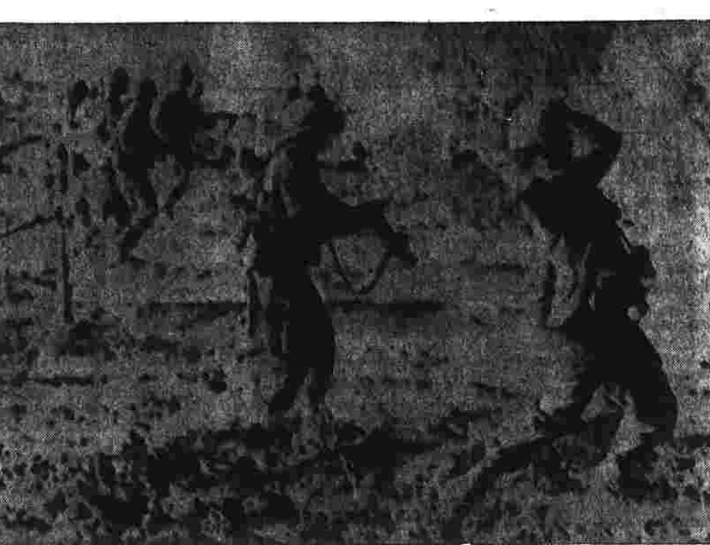
Skirmish line of U.S. infantrymen moves forward, throwing grenades, toward Viet Cong positions at the edge of a rubber plantation near Cu Chi, South Viet Nam. The action took place as the 26th Division attempted to expand its perimeter.